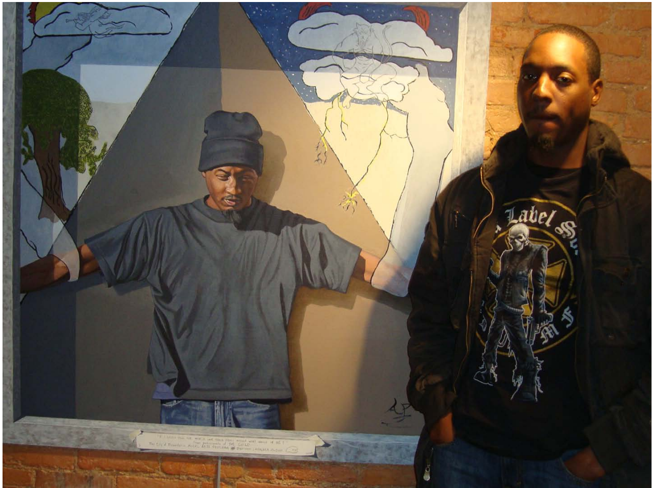
Self-portrait of program participant